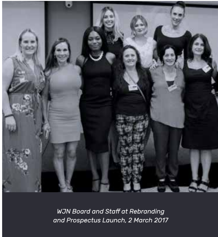
WJN Board and Staff at Rebranding and Prospectus Launch, 2 March 2017