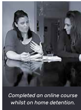
Completed an online course whilst on home detention.