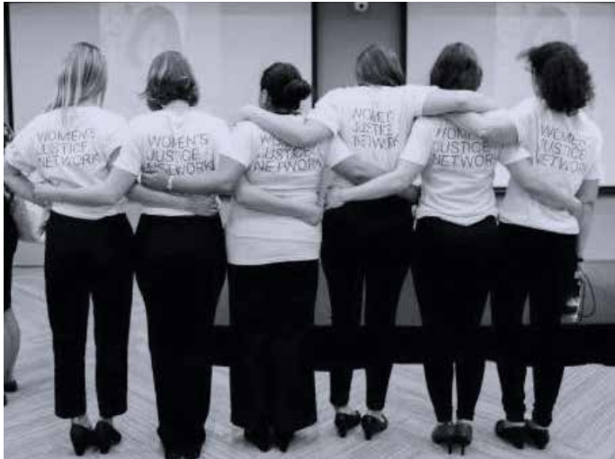
WJN Volunteers at the Rebranding and Prospectus Launch, 2 March 2017