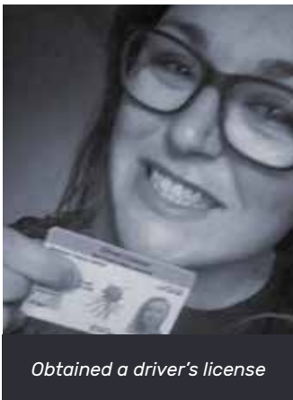
Obtained a driver's license

Current funding allows for just 50 triumphs per year for our adult program. With greater financial support the positive life changes are endless.