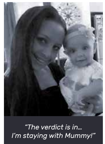
"The verdict is in... I'm staying with Mummy!"

Having her beside me gave me strength and allowed me to understand what exactly was going on. All of a sudden, my depression lifted. Life was no longer a non-stop nightmare. Now two years on, I still have my little girl and I see my older children once a month. I no longer feel that I need drugs. I no longer feel that I need to put up with a man treating me like crap. In a few years time, I will contact WJN. This time around, I will be the Mentor."