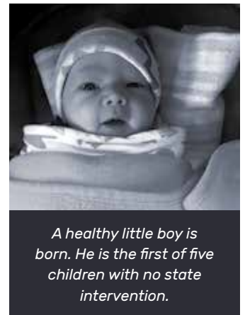
A healthy little boy is born. He is the first of five children with no state intervention.