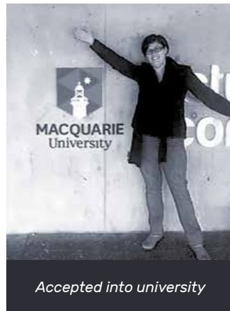
Accepted into university